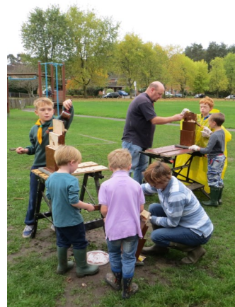
Painting the bat boxes

Volunteer days to clear invasive plants from the heathland.