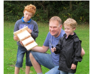
A finished Bat Box

We used the Kent Bat Box design as the basis for our boxes. We had to “rough up” the internal surfaces to allow the bats to grip them. We added a roofing felt cover to try and improve durability. We painted the exterior of the wood but taking care that the paint was animal friendly and didn't contain wood preservatives. Please see the Bat Conservation Trust website for more information about bats.