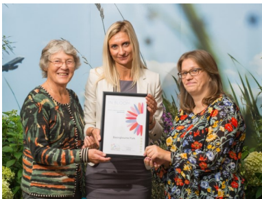
Environment Silver Gilt Award

Friends of Basingbourne Park were major contributors towards securing these achievements – particularly on the conservation front where our members have taken a real interest and made a significant impact to maintain the biodiversity of the site.