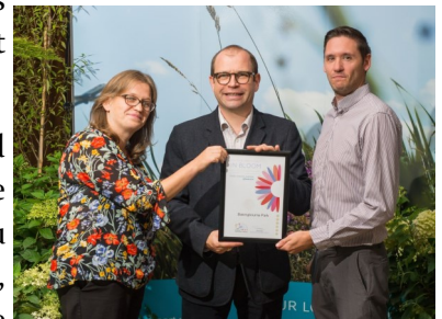
Small Park Silver Gilt Award

Well done to everybody who has contributed over the last few years. Hopefully you'll all take pride in these achievements. May this spur you on to consider playing a greater role next year, so that we can try and maintain or even improve on this year's achievement.