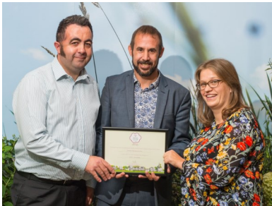
It's Your Neighbourhood Award

We are delighted to announce that Friends of Basingbourne Park have been awarded "Level 5 - Outstanding" the top level award in the "RHS It's Your Neighbourhood" Awards for 2017. This is the highest level achievable.