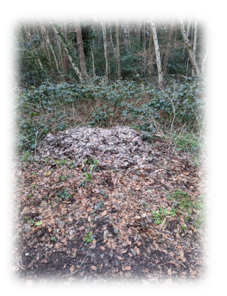
Dumped Garden Waste

Do you get really angry when you read about or see fly tipping? Most of us do, but many of us don't realise that we may be unwittingly contributing to this blight if we live near our parks and green spaces! Often people see a bit of "scrub land" or "wasteland" over their fence or at the end of their road and think it's acceptable to dump garden waste and other things there. They may even feel they are entitled to do this "because most of the leaves have come from trees in the park/woods anyway". Whilst this may have been commonplace and acceptable in the 1960s and 1970s, most of these areas are now recognised as valuable green spaces to be treasured and utilised by the local community for leisure and relaxation, and as oases in our urban environments to encourage and support wildlife.