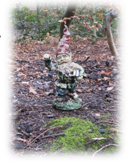
Found in the woods

increasingly understands the real value of these islands of green amongst us, and recognise that they are for all of us, both to use and to care for. Please help us by ensuring that you take responsibility for all your own waste, and spread the message to neighbours, family and friends, and why not even join us for one of our conservation volunteer days!